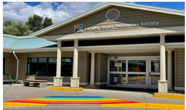
Photo of Langley Senior Resources Society.

This spring and summer I will be hosting town halls on heritage and climate change. I am excited to get back to hosting community discussions as we are able to meet safely and within public health guidelines.